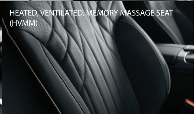
HEATED, VENTILATED, MEMORY MASSAGE SEAT (HVMM)