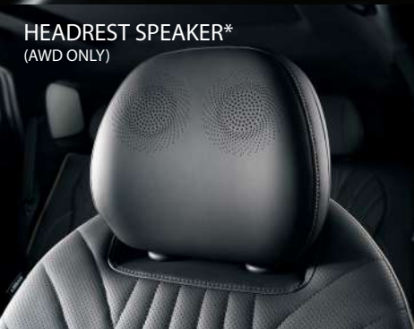
HEADREST SPEAKER* (AWD ONLY)