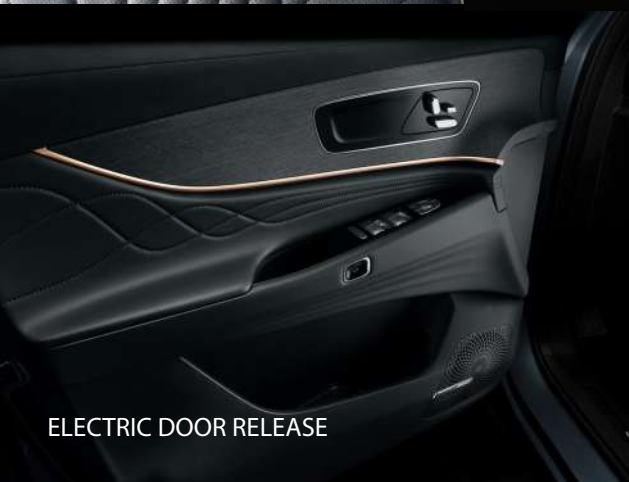
ELECTRIC DOOR RELEASE