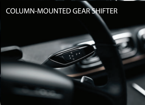
COLUMN-MOUNTED GEAR SHIFTER