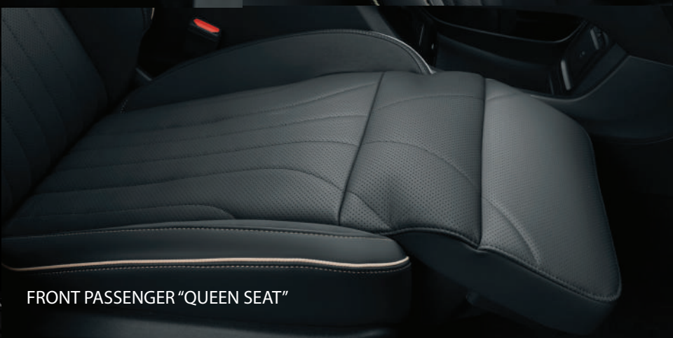
FRONT PASSENGER "QUEEN SEAT"